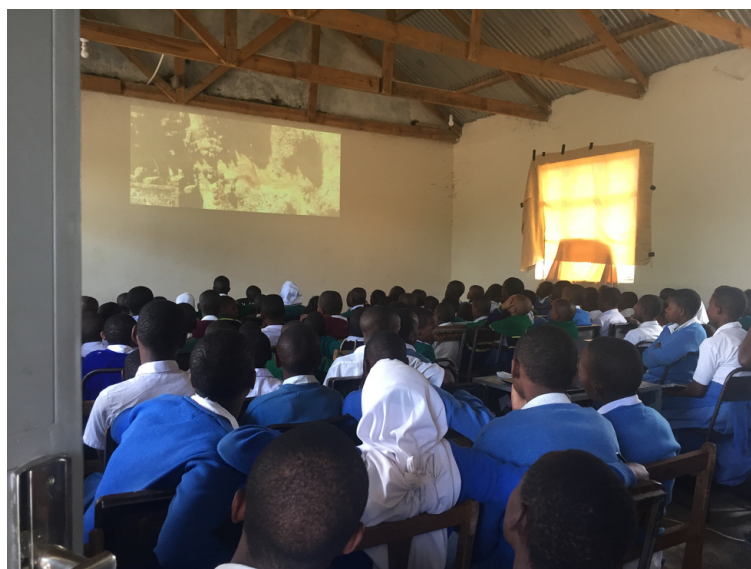
Photo 1: Environment student club seminar on Ecosystem Photo 1: Pictures for the World Environment Day seminar event