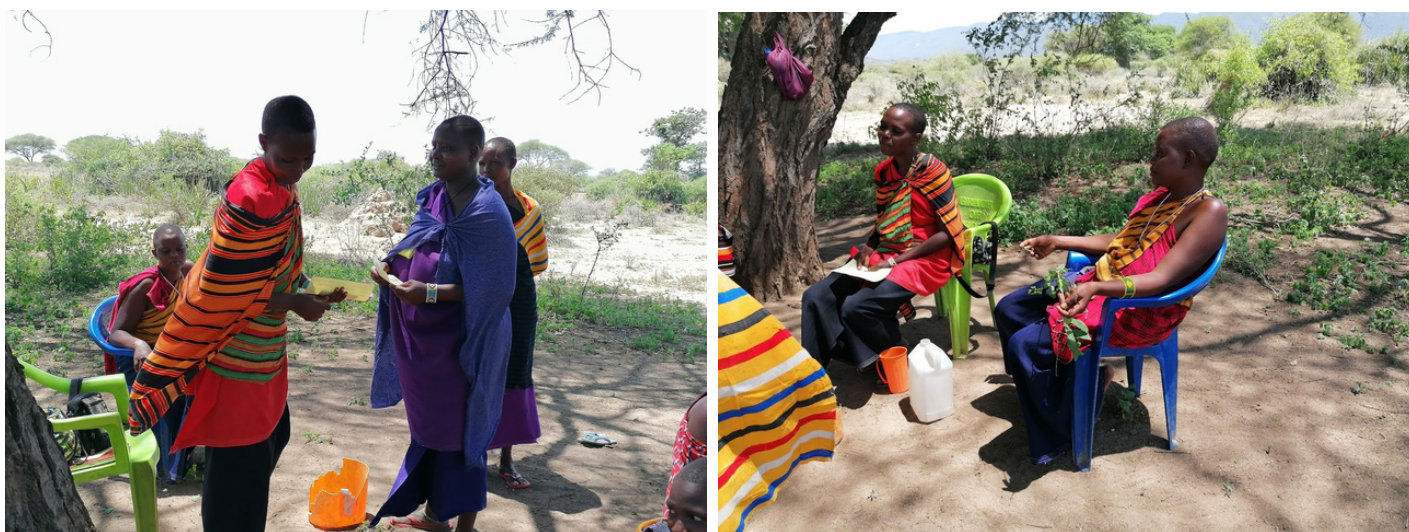
Photos showing Serengeti group in role play

In another seminar session, the group was asked to use illustration through drawings, for example, a tree or house in order to realize the importance of each element in the same set. The participants enjoyed and learned from these sessions.