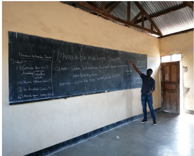
HBCs in the training session with Afya project manager