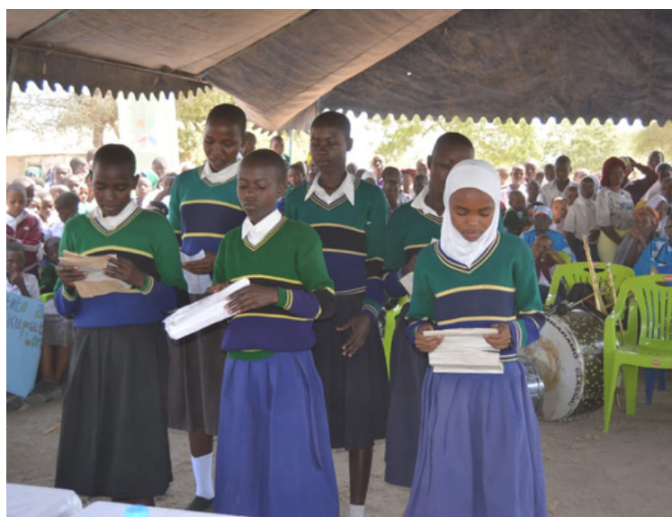
Photos from the African Child day event in Londoto village.